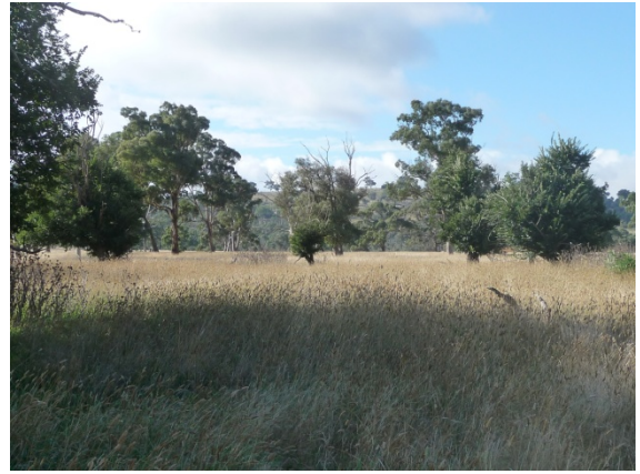
Mulligan's Flat Ploughlands