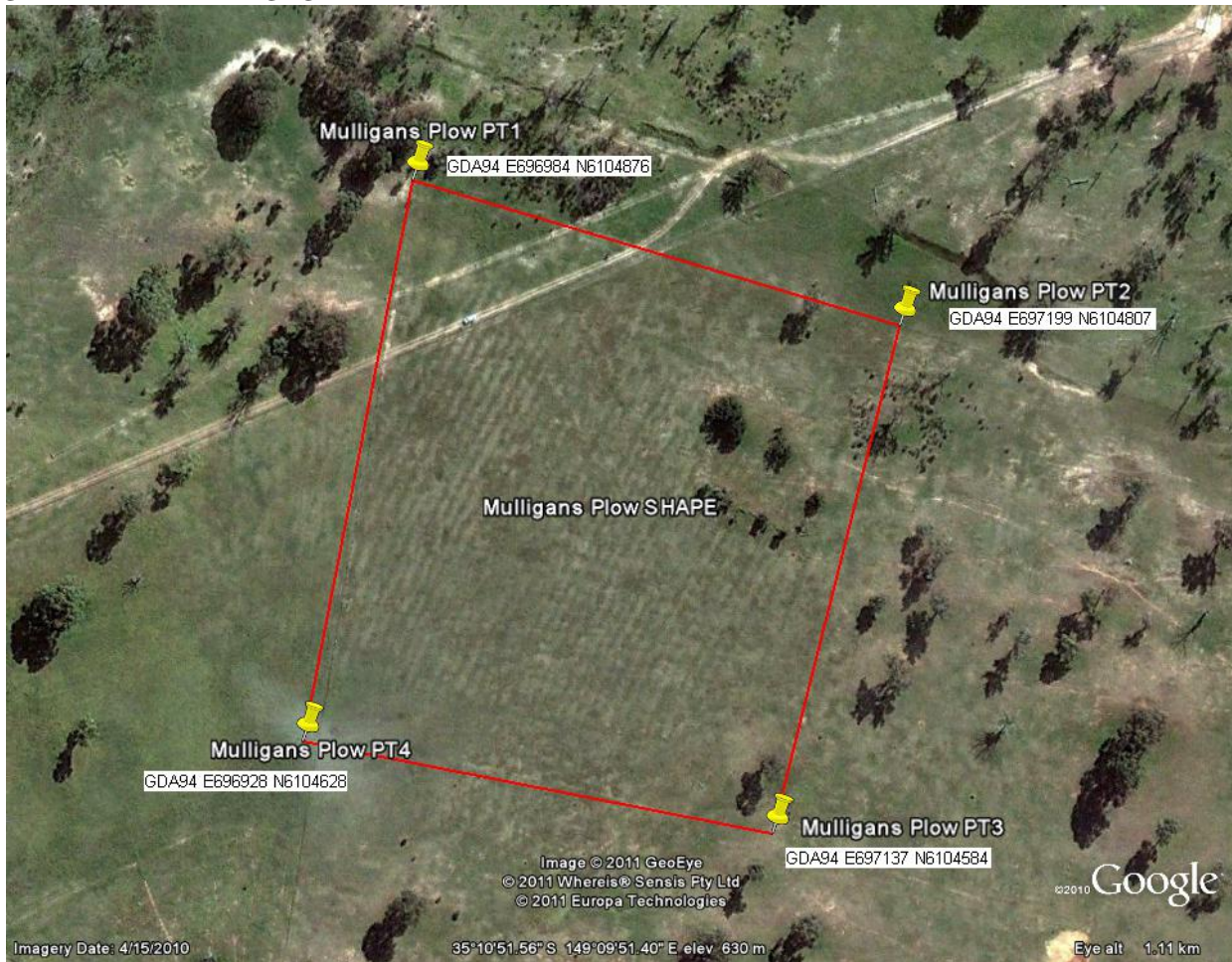
Mulligan's Flat Ploughlands Site, as indicated by solid red line. Boundary to the west follows a fence line.