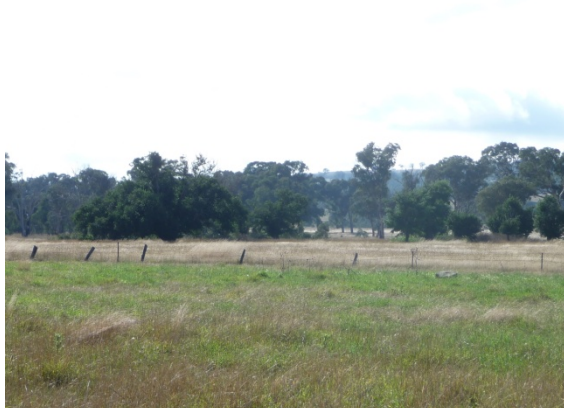
Mulligans Flat Ploughlands site – shown as long, dry grassy paddock, with exotic plantings