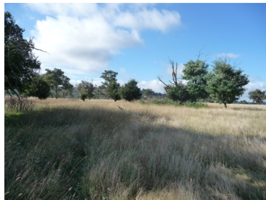
Mulligan's Flat Ploughlands