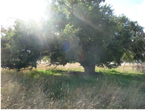
Mulligan's Flat Ploughlands, exotic plantings