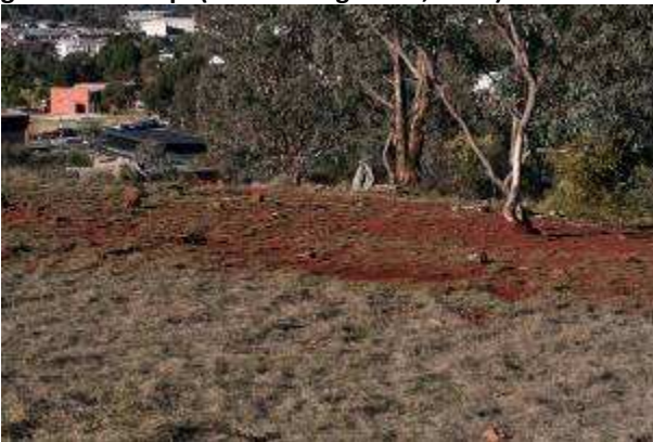
Image 3 Gossan Hill - red sediments adjacent to outcrop. (ACT Heritage Unit, 2013)