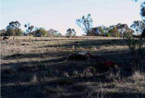
Image 2 Gossan Hill - northern spur looking south at gossan outcrop. (ACT Heritage Unit, 2013)