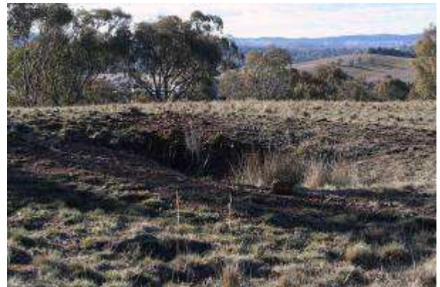
Image 4 Gossan Hill - likely costean pit for testing underlying mineralisation. (ACT Heritage Unit, 2013)