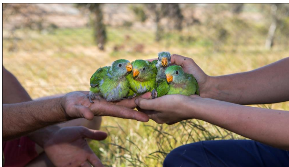
Figure 2. Superb parrot nestlings retrieved from nest tree.

Clutch size and hatchling data are best estimates because hollow structure precluded access to the chamber floor at two nests. We estimated that the maximum number of eggs laid at identified nests was 21, all of which were incubated between mid-October and early-November. We calculated a mean clutch size of 4.2 in the 2016 breeding period. Eggs that failed to hatch were found unhatched inside the nest hollow ( n = 2 ). From the 5 active superb parrot nests located, we monitored 17 nestlings, of which 11 were banded (with ABS and colour bands; see Appendix B). We collected genetic samples and morphology data from all accessible nestlings ( n = 13 ).