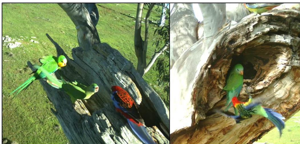
Figure 4. Examples of nest-site competition. LEFT: A female superb parrot defends her nest against crimson rosellas. RIGHT: A female superb parrot attempts to nest in a 2015 hollow now occupied by eastern rosellas.