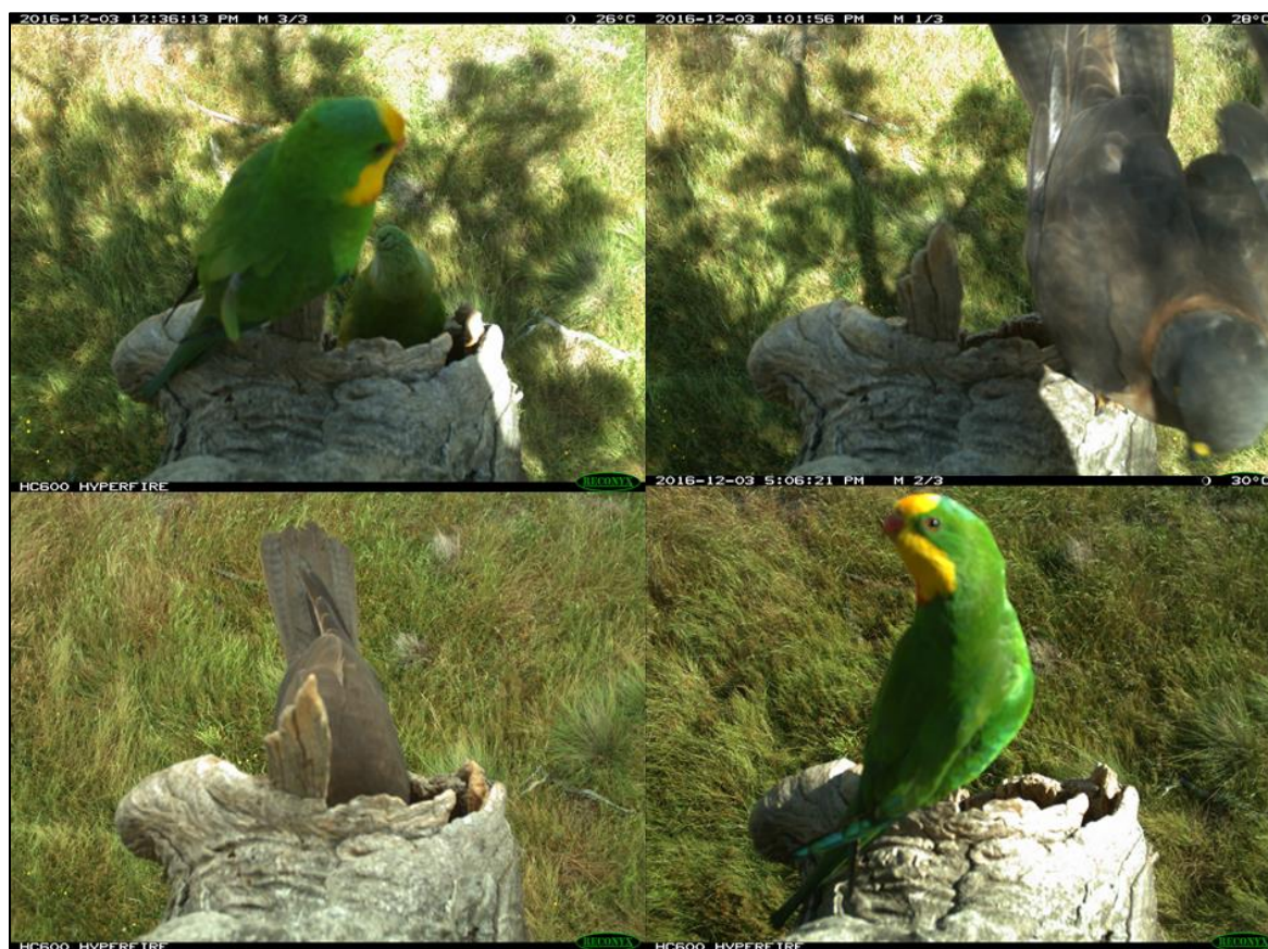
Figure 3. Successful predation of a superb parrot nest by brown goshawk.

We estimate that approximately 13 superb parrot nestlings fledged successfully. One nest was successfully predated by a brown goshawk Accipiter fasciatus on the 3 rd December 2016 (Figure 3). The nest contained three superb parrot nestlings, all of which were removed (and presumably consumed). This is the first confirmed predation of a superb parrot nest at Throsby or Spring Valley. No other predation attempts were clearly identifiable, although cameras captured numerous images of brushtail possums Trichosurus vulpecula and avian predators (e.g. Australian Raven Corvus coronoides and Kookaburra Dacelo novaeguineae ) at nest hollows. Our cameras captured a successful predation event at a 2015 superb parrot nest hollow, where a brushtail possum consumed a crimson rosella.