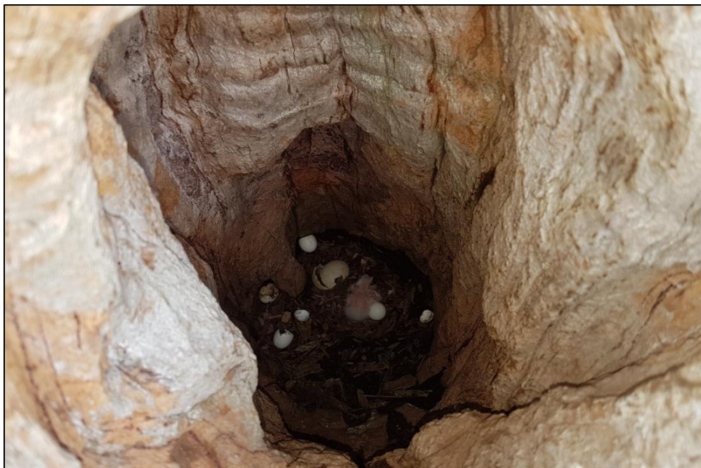
Figure 5. Superb parrot nest hollow that was predated in 2016. This image was taken prior to predation and reveals two superb parrot hatchlings (less than 3 day old), one unhatched superb parrot egg, and a hatched sulphur-crested cockatoo egg from the previous year.