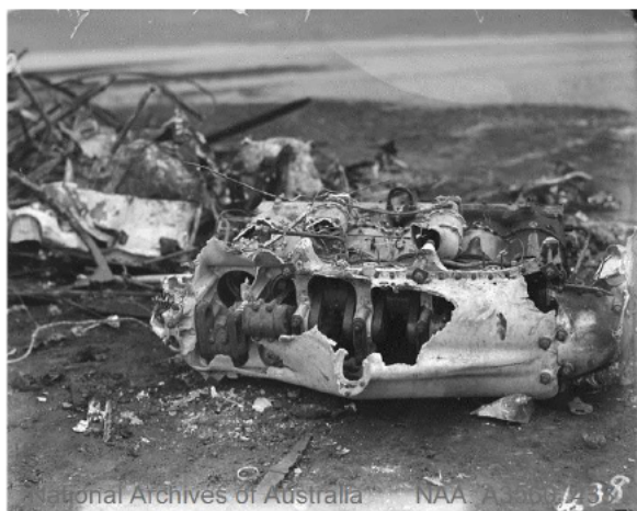
Image 5: Aircraft crash - DH9 aircraft, serial A6-28, which crashed at the original Canberra Aerodrome on 11 February 1926 (NAA: A3560, 438).