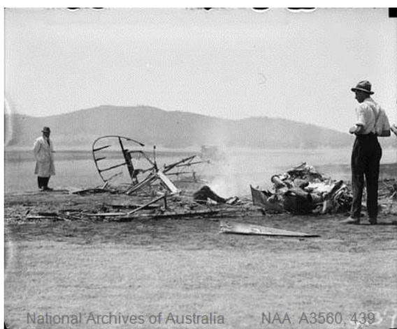
Image 6: Aircraft crash - DH9 aircraft, serial A6-28, which crashed at the original Canberra Aerodrome on 11 February 1926 (NAA: A3560, 439).