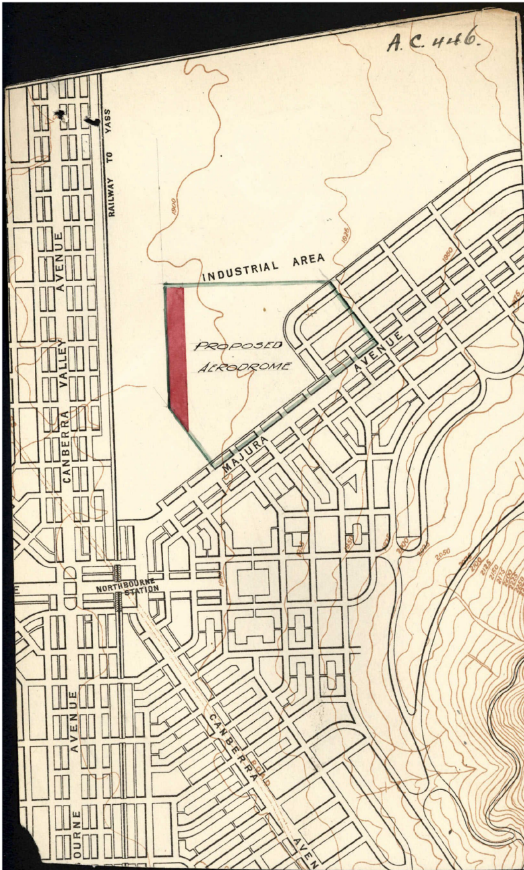
Image 4: Plan No. A. C. 446 sent from the Secretary of the Federal Capital Advisory Committee to the Minister of Works and Railways on 10 May 1923 (NAA: A199, FC1924/447).