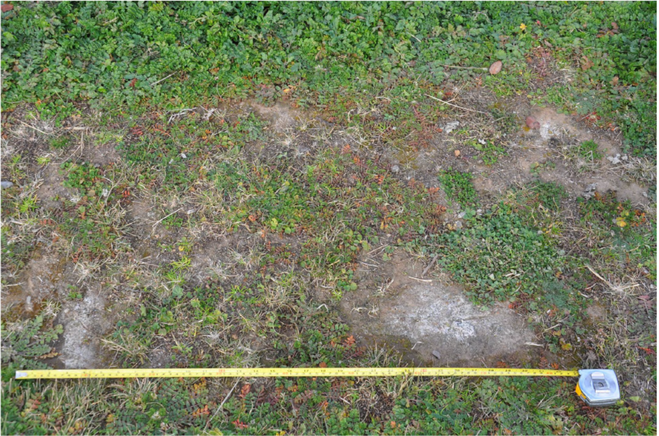
Image 9: Possible remnant of Lockspit A (provided as an attachment to the nomination)