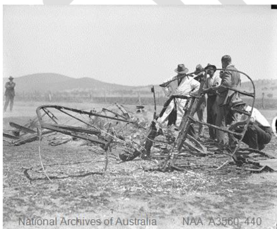
Image 7: Aircraft crash - DH9 aircraft, serial A6-28, which crashed at the original Canberra Aerodrome on 11 February 1926