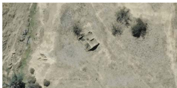
Aerial views of the Majura Stone Cottage