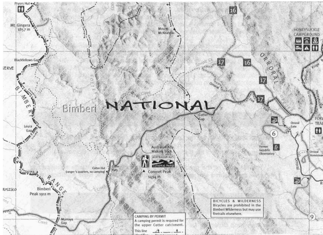
Figure 1 Location plan for the Cotter Hut