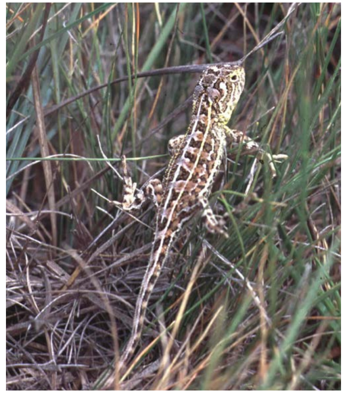
Endangered Grassland Earless Dragon in tussock

it has died out. Other than habitat destruction and fragmentation, the key threats to the species are drought and overgrazing resulting in a failure of recruitment of young into the adult population.