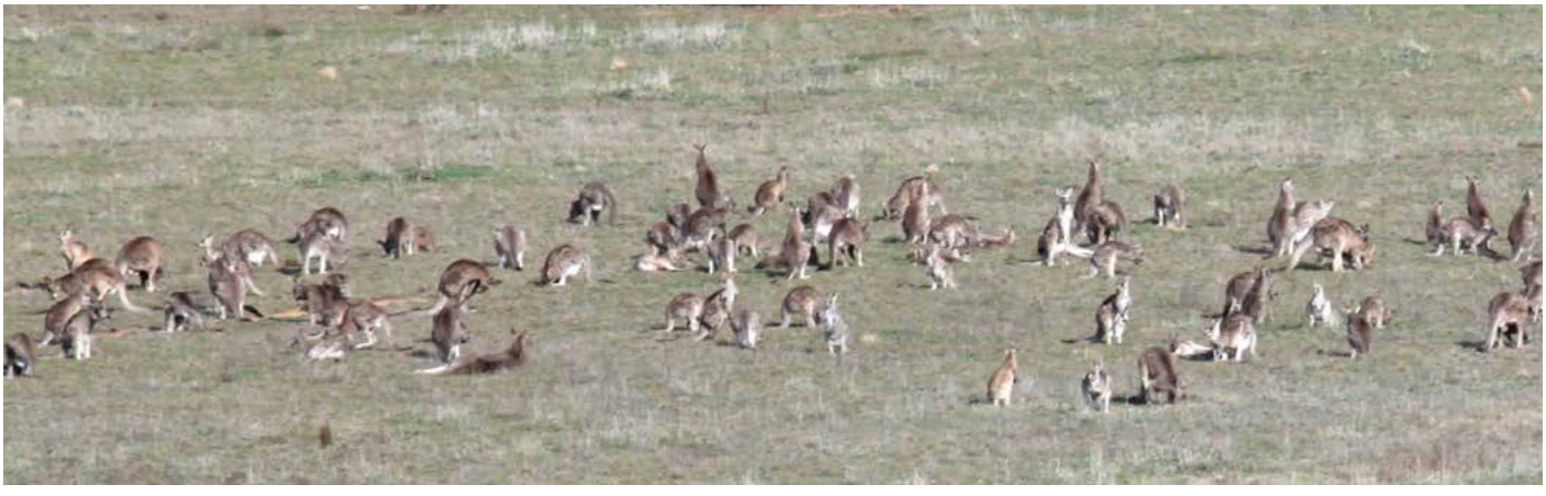
Eastern Grey Kangaroos loafing in the sun

reptile, kangaroo numbers should be limited to less than 1.2 kangaroos/ha, but with some level of grazing maintained to promote the mix of short and tall grass that the Striped Legless Lizard prefers. Although the study was conducted in grasslands grazed by kangaroos in the ACT, the results have implication for management of grazing outside the ACT and for both native and domestic herbivores. The recommendations made in this study for the conservation of the Striped Legless Lizard are likely to benefit a range of grassland species, e.g. the endangered Grassland Earless Dragon.