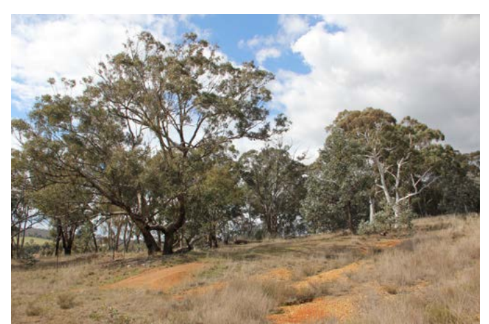
Box-gum grassy eucalypt woodland in Goorooyarroo

McIntyre et al. (2010) cite the extremely high kangaroo densities in ACT reserves, being the highest reported densities of any wild kangaroo populations (higher densities were later reported from Victoria). The study indicated that biomass was consistent with high grazing pressure from the high density of EGKs. The study concluded that ACT reserves are under extremely high grazing pressure sufficient to affect soil processes and