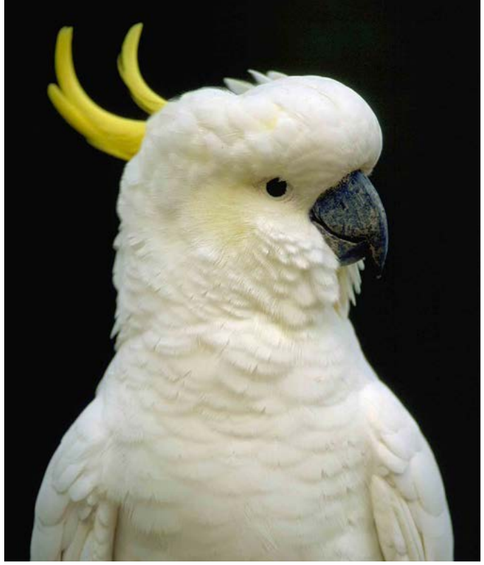
Sulphur Crested Cockatoo

whereas birds that nested on the ground and relied on grass for concealment from predation, and birds that fed on invertebrates above the grass layer (i.e. aerial insectivore) were both more common under low grazing intensities. Large bodied (> 250g) ground-foraging birds (e.g. galah, sulphur-crested cockatoo, white-winged chough) were most common at very high grazing intensities and appear to benefit from a very open grass layer. Small ground-foraging species (e.g. crested pigeon, magpie-lark, red-rumped parrot, superb fairywren) were most common at moderate to high grazing intensity and declined at very high and low grazing intensities. This study concluded that a mix of low and high grazing intensities will be important in promoting a diverse bird assemblage. The authors suggest that the duration of very high grazing events should be limited to prevent simplification of habitat and loss of food items.