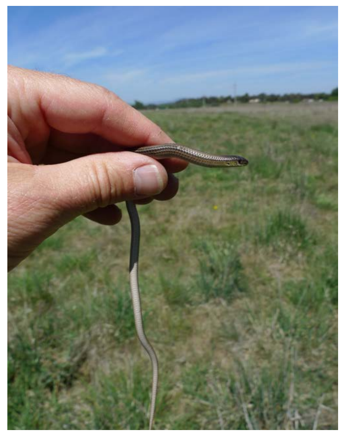
Striped Legless Lizard

This study found that the Striped Legless Lizard can occupy even small and degraded grasslands provided there is sufficient grass and high kangaroo numbers are avoided. The authors recommended that to ensure the ongoing conservation of this threatened