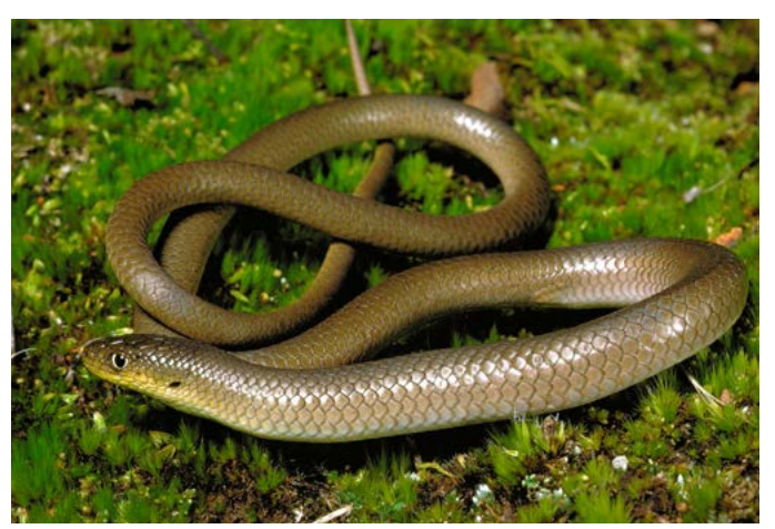
Olive Legless Lizard (Delma inornata)

The results of this study provide two lines of evidence supporting the current approach for setting kangaroo