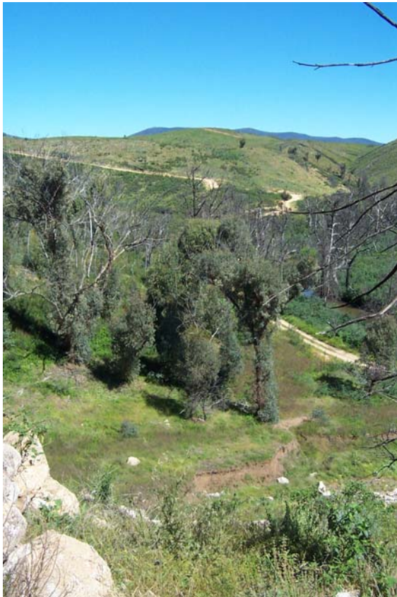
View north from main Cotter Cave.