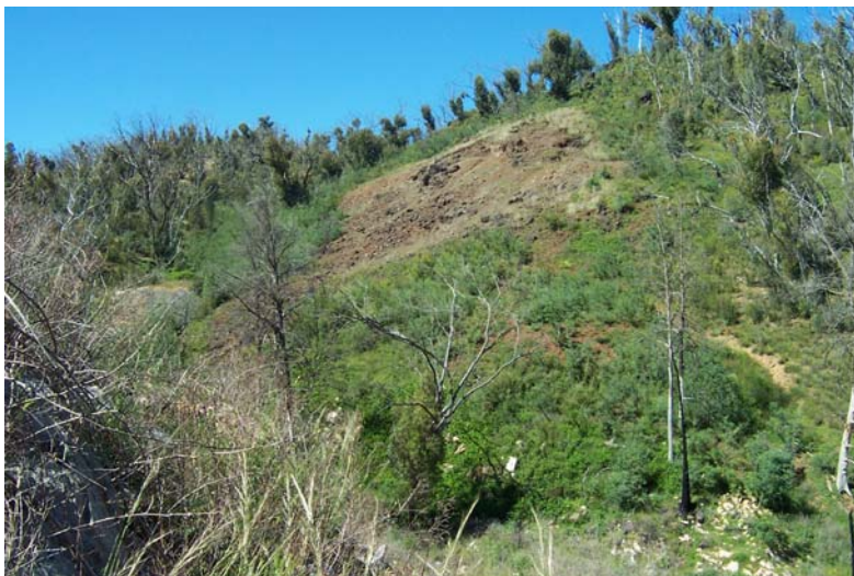
View south from main Cotter Cave showing the hill face that contains some of the mine shafts.