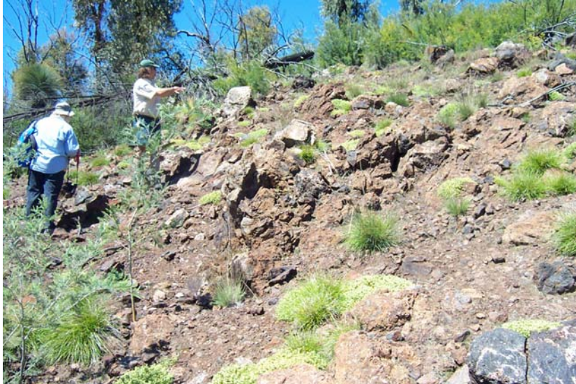
Site of upper population of Drabastrum alpestre .