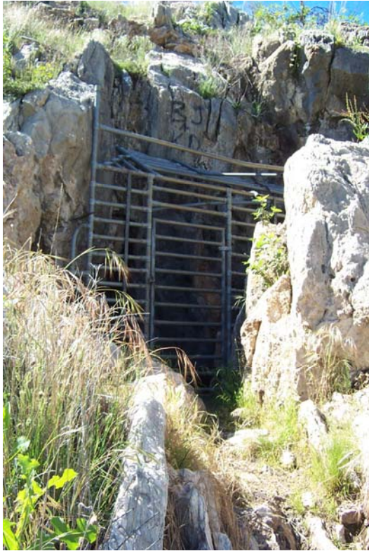
Entrance to main Cotter Cave