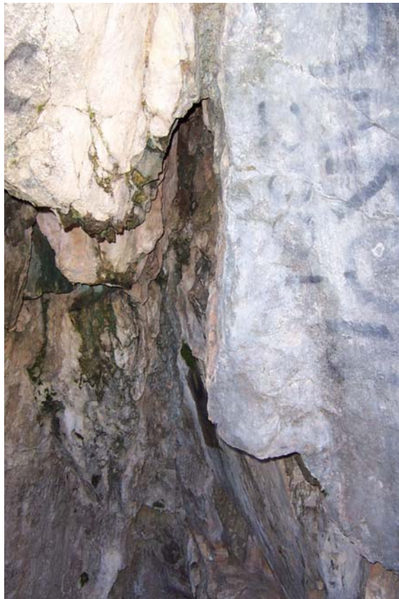
Main Cotter Cave