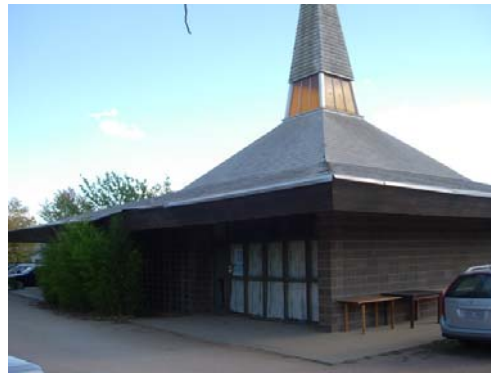
Figure 4. Holy Trinity Lutheran Church, NE corner (Truscott 2008)