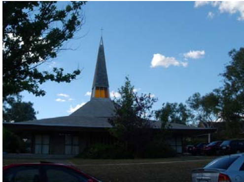
Figure 1. Holy Trinity Lutheran Church, S façade (Truscott 2008)