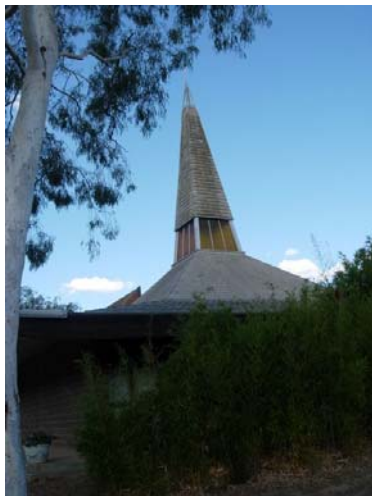
Figure 3. Holy Trinity Lutheran Church, W façade (Truscott 2008)