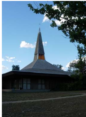
Figure 2. Holy Trinity Lutheran Church, S façade (Truscott 2008)