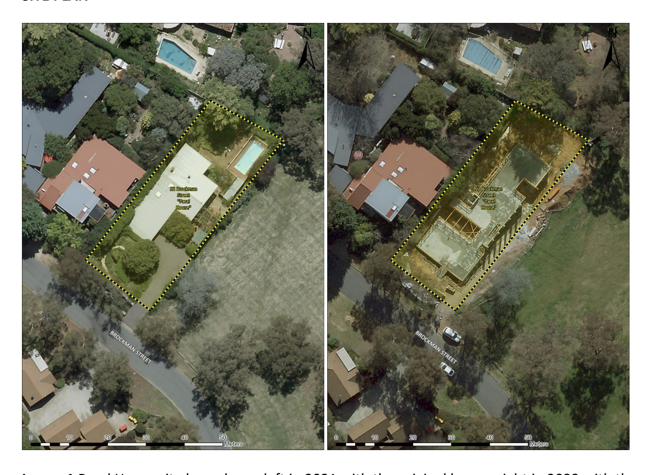
Image 1 Paral House site boundary – left in 2021 with the original house, right in 2022 with the new house mid-construction.