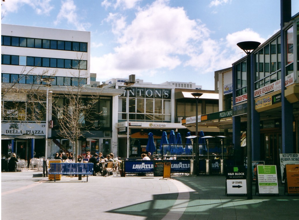
Garema Place outdoor cafés, Canberra