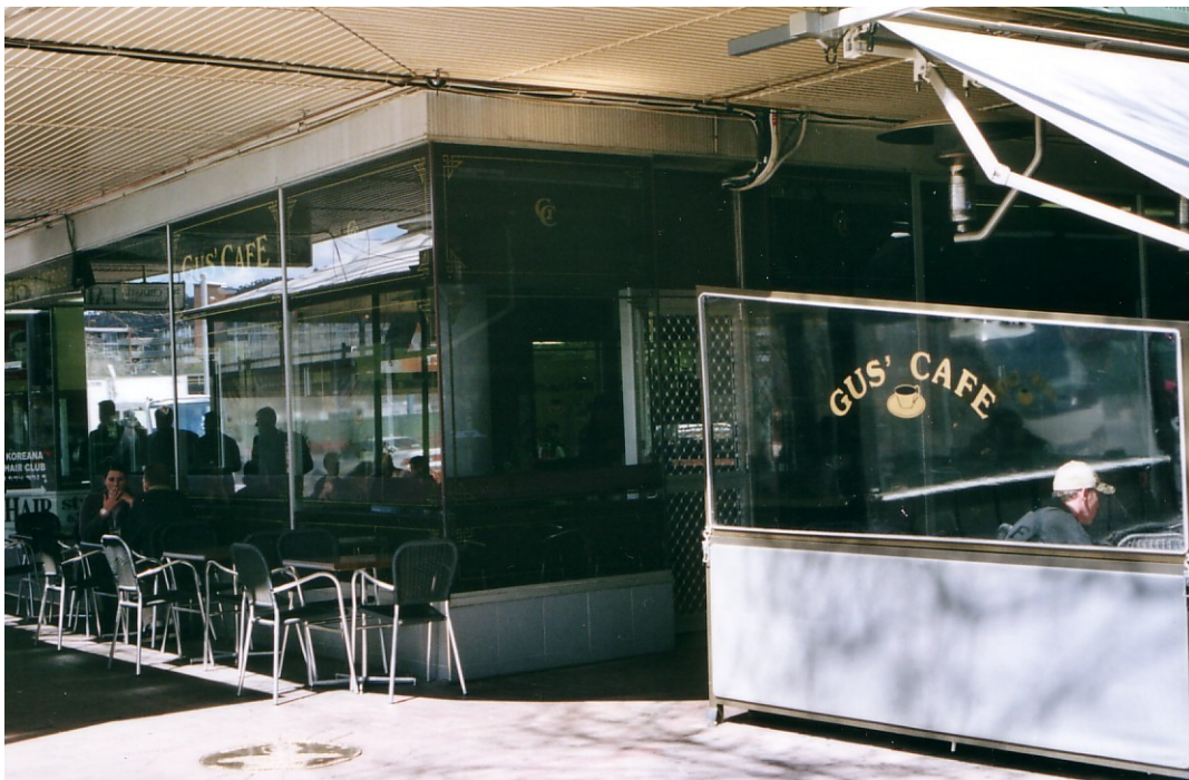
Gus' Café, Bunda Street, Canberra Photo – M. Park (2004)