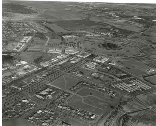
1958 aerial imagery with Turner Hostel to the centre right. NCDC photo library ca 3/7/58