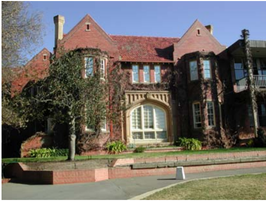
Figure 3: East Wing (1929)