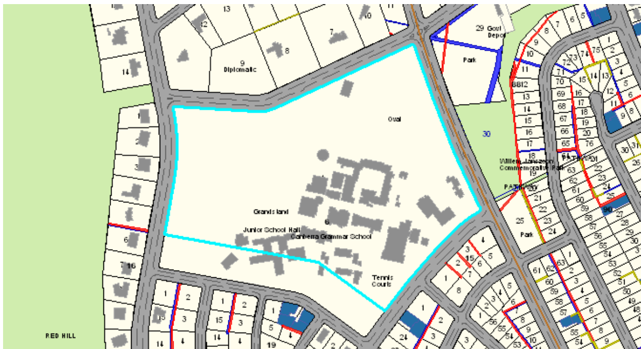
Figure 2: Plan of Canberra Grammar School