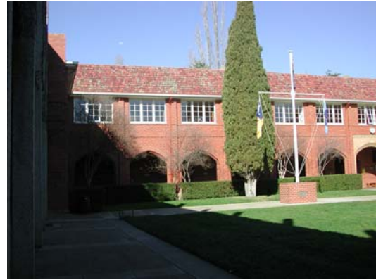
Figure 4: East Wing Cloisters (1929)