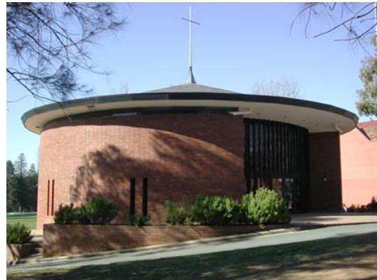
Figure 12: Canberra Grammar School Chapel (1965)