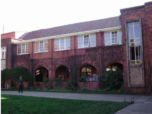
Figure 7: Garran House (1939)