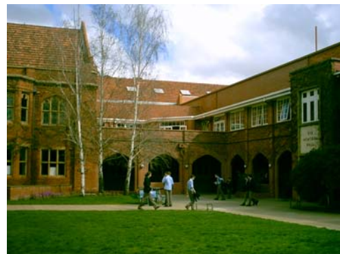
Figure 8: Gymnasium (1958)