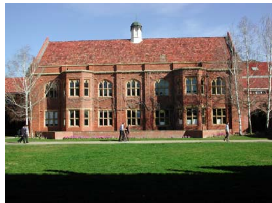
Figure 6: Former Dining Hall and Kitchen (1939)