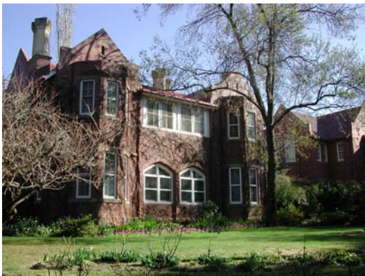
Figure 5: Headmaster's Residence (1934)