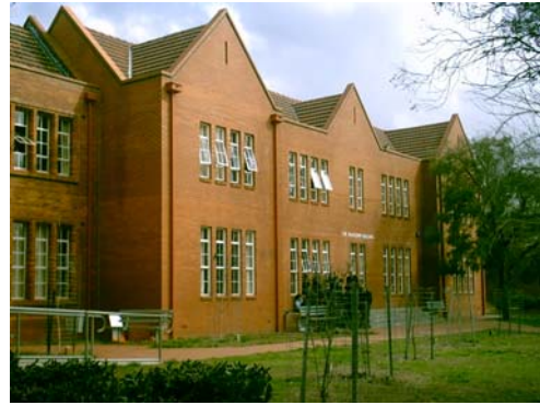
Figure 10: McKeown Building (1985)