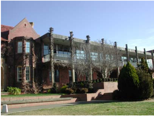
Figure 9: Science and Administration Wing (1962)