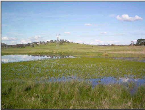
Dunlop Grasslands Pond. Eight frog species were detected at this site.