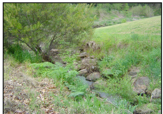
Chinaman's Creek, Yass. No frog species were detected at this site.