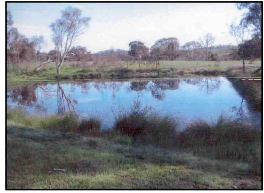
Rose Cottage dam. Six frog species were detected at this site.