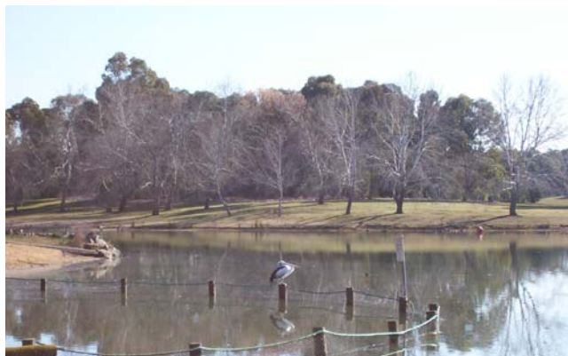
Table 21: Site 318 Lake Ginninderra East Arm

Two sites are monitored in Lake Ginninderra, one near the inflow in the East Arm (Site 321) and the other at the outflow dam wall, or West Arm (Site 318). Water quality in the lake was good and generally better than the other lakes monitored.