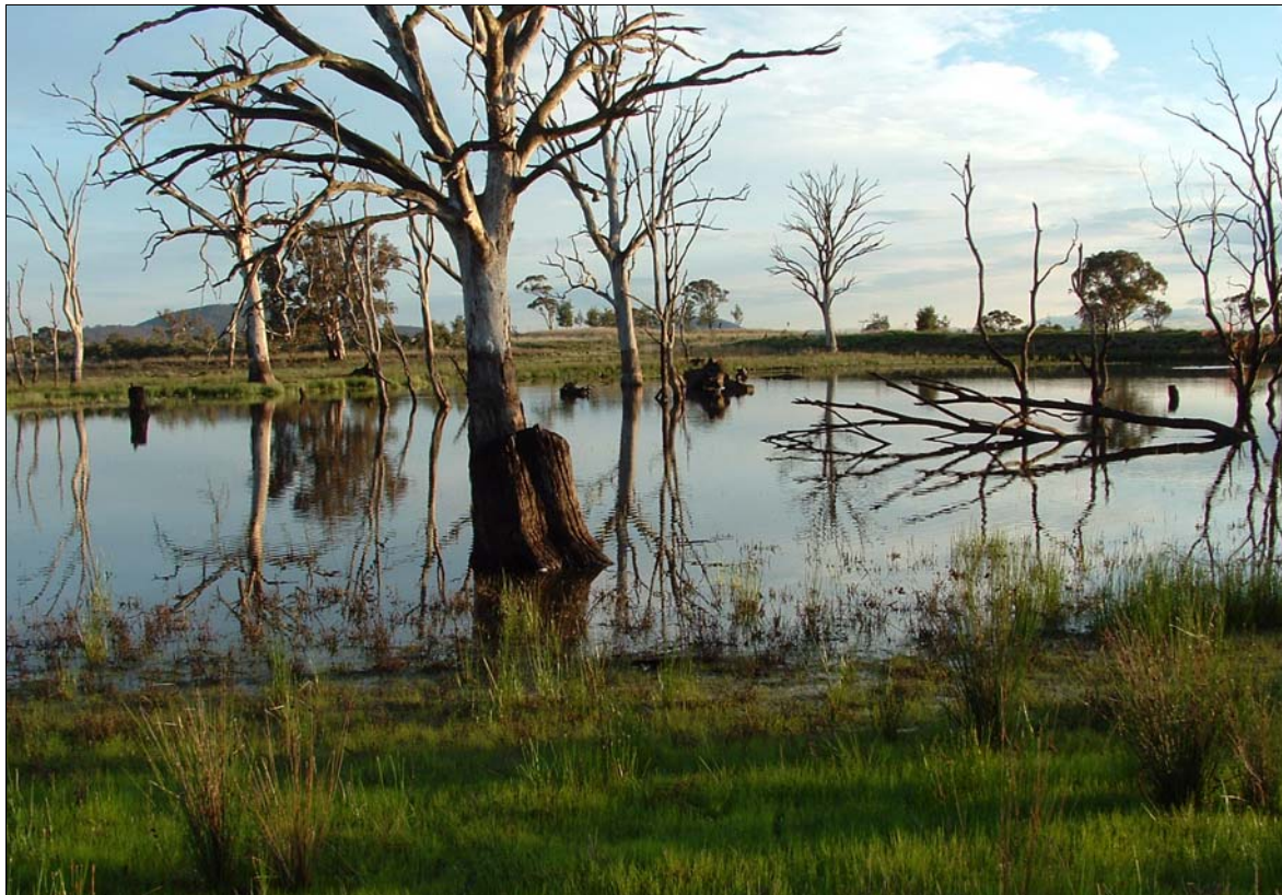
Figure 3. Mulligans Flat Site 11. Six frog species were detected at this site.

There were 11 sites where no frogs were heard calling.